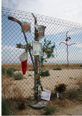
Figure 1. Shrines emplace memory. Avenue M, near the Sierra Highway, south of Lancaster, California, U.S., 2006.