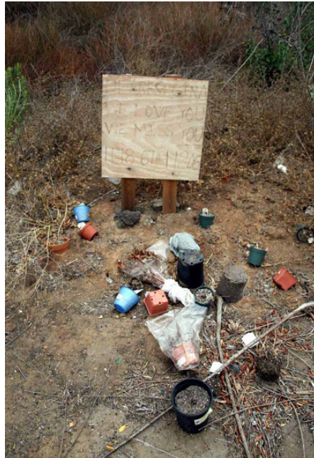
Figure 11. Interstate Highway 35 at MLK Boulevard, Austin, Texas, U.S., 2008.