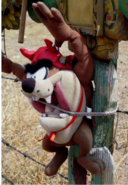
Figures 12, 13. Interstate Highway 25, north of Albuquerque, New Mexico, U.S., 2006 and 2010.