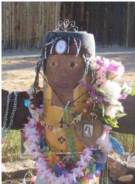
Figures 14, 15. North-east corner of Rodeo and Yucca, Santa Fe, New Mexico, U.S., 2003 and 2006.

Thus, one of the things shrines do as memory forms is to re-create the lost body's ability to live long enough to die of natural causes. Sometimes this fact is so evident that it is uncanny, as in the case of a shrine north of Albuquerque, New Mexico (see Figures 12-13). The site has featured a stuffed cartoon Tasmanian devil at least since I took the first picture in 2006, where he appears new. In 2010, I photographed the site again and 'TAZ' has a new friend and graying eyebrows. 18 Clearly, the iconic and anthropomorphic aspects of these objects contribute to the uncanny feeling. It is even more pronounced when, as in another shrine from New Mexico, the central figure at the site takes on human form (see Figures 14-15).