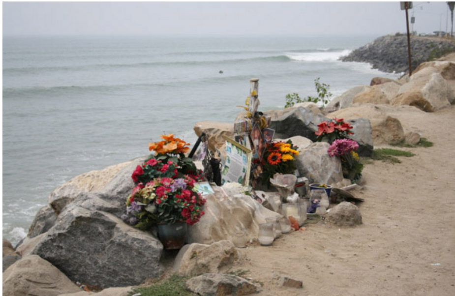
Figure 6. U.S. Highway 1, Pacific Coast Highway, Malibu, California, U.S., 2006.

A shrine with staying power prolongs its existence because it is continually renewed—actively maintained by friends and family members. They visit the sites and re-decorate them on holidays, as well as the victim’s birthday and significant days in their familial lives such as wedding anniversaries. Some sites sustain central elements across these revisions while removing the older objects, while others simply add to the existing objects, sometimes re-arranging them. At some sites there is a coherent and clean revision, while at others, the collection grows and contracts from the centre, often spilling out of the defined space of the shrine.