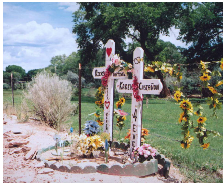
Figures 7, 8. New Mexico State Highway 76, west of Chimayo, New Mexico, U.S., 2003 and 2010.

At these long-standing shrines, the ongoing temporal production of space-bound memory asserts a certain kind of indefinitely accumulating time, where the shrine takes on a life of its own through the continually unfolding production of space. This indicates that the evolving life of the shrine is predicated on a kind of transference between the life of the victim and the life of the shrine. At some shrines, the transference of life to a material object is made even more literal when a plant is grown at the site. If it is cared for long enough to be established, it will develop over time, taking the place of the person whose life is now separated from time.