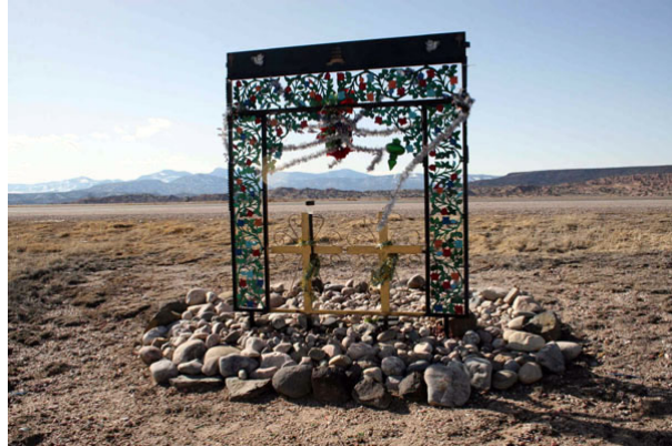
Figure 2. Shrines enclose memory. U.S. Highway 285/84, south of Española, New Mexico, U.S., 2010.