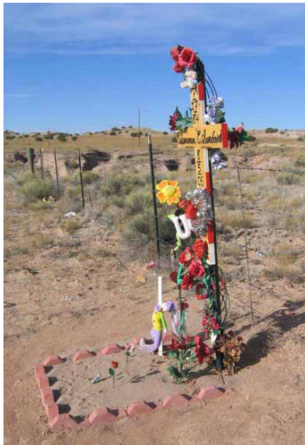
Figures 3, 4. Shrines manage memory. U.S. Highway 285/84, north of Santa Fe, New Mexico, U.S., 2006 and 2010.