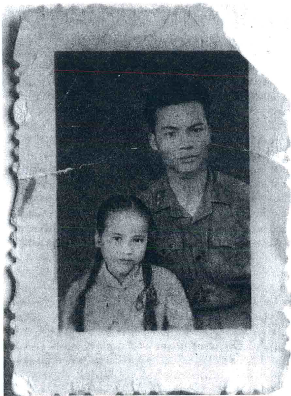
1. Photograph left at the Vietnam Veterans Memorial.

charged with loss. Where is that little girl now, did she survive the war or is she also memorialized here? Why did her father hesitate?