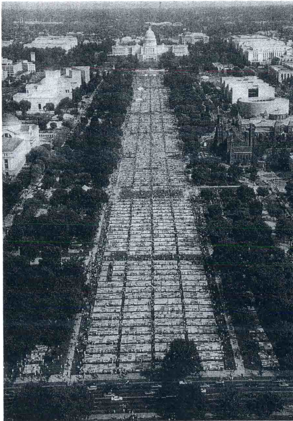
2. The AIDS Quilt, Washington, D.C., October 1996.

Like the memorial, the quilt memorializes primarily through naming the dead, yet this naming is individualized through the testimony, objects, and photographs embedded within the quilt. In many ways, the quilt presents a conversation with the dead, in which questions are asked, testimony provided, and entreaties presented, all with the implication that the dead are located within the quilt and can witness and listen from there. The voices of the quilt speak to an imagined audience, often perceived as either the community of people affected by AIDS or as a naïve and uninformed audience that needs to be educated as to the value of the lives lost (illus. 3).