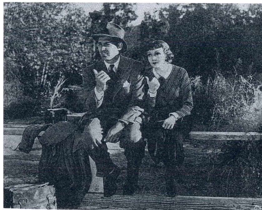
Plate 1.2 Gable and Colbert: the heterosexual couple on the road in It Happened One Night .

road has always functioned in movies as an alternative space where isolation from the mainstream permits various transformative experiences, the majority of road films made before the 1960s more successfully imagined an ultimate reintegration of road travelers into the dominant culture. Certain perpetual wanderers of the 1930s, most famously Tom Joad (Henry Fonda) in The Grapes of Wrath , might emerge in the genre, and other such defiers of the law might perish at the hands of an unforgiving society, as in the outlaw couple (Fonda and Sylvia Sydney) in You Only Live Once , but such cases were the exception rather than the rule. More paradigmatic of the “classic” road film is It Happened One Night , the big Academy Award winner of 1934. Its female protagonist, Ellie Andrews (Claudette Colbert) flees the oppression of her wealthy class background, and she finds her liberation in the “normality” of the people she meets on the road, most notably her unexpected companion, newsman Peter Warne (Clark Gable). The significance of their coupling is condensed when he teaches her how to dunk doughnuts: “Forty million dollars and you don’t know how to dunk,” he observes with scorn. “I’d change places with a plumber’s daughter any day,” she replies; and moments later, when her father’s detectives come into their motel room to question them, she pretends that she is such common “folk,” which allows her to escape their