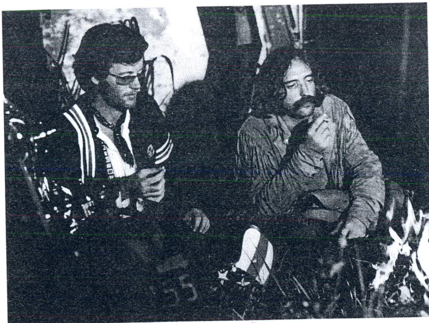
Plate 1.1 Easy Rider . Dennis Hopper and Peter Fonda go in search of America and discover that “We blew it.”