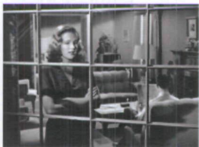
Fig. 27 The Woman in the Window 2