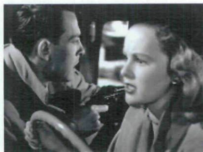
Fig. 21 Hampton, Cross-purposes: "Shoot!"