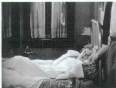
Fig. 17 Bart's Hand