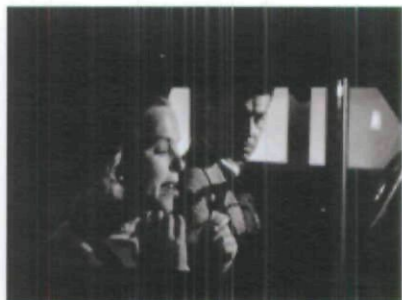
Fig. 25 The Woman in the Mirror 2