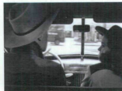
Fig. 7 Disguises 3: Work clothes