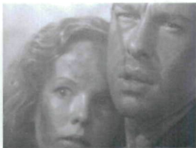
Fig. 36 Waking Dream