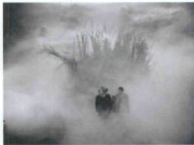
Fig. 38 The False World