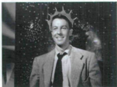
Fig. 6 Disguises 2: Gun King Bart