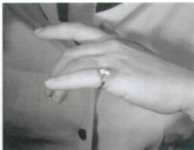
Fig. 18 Laurie's fingers