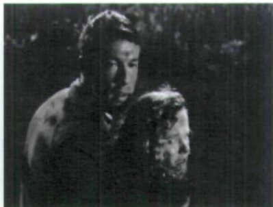
Fig. 34 Looking Back at the Look Forward