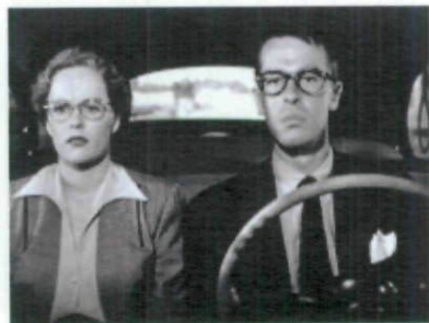
Fig. 8 Disguises 4: Nice, Young Couple