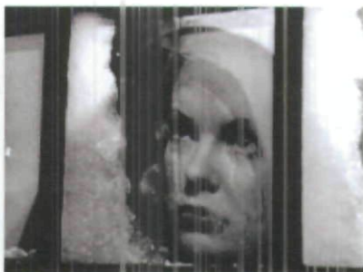
Fig. 26 The Woman in the Window 1