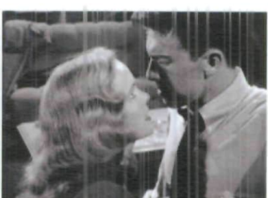
Fig. 16 Finally face to face. "I'll do anything."