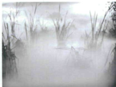
Fig. 37 Sunrise, Dreamscape