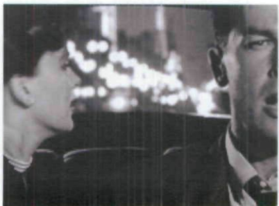
Fig. 31 Hampton in Reverse