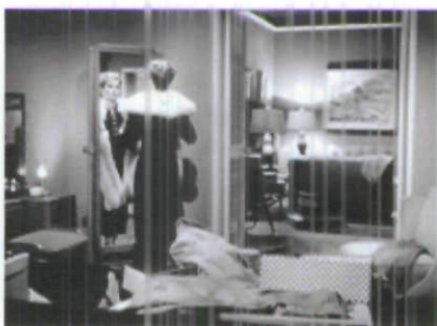
Fig. 28 The Woman in the Mirror 3