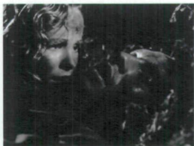
Fig. 35 Face to Face, Mouth to Mouth