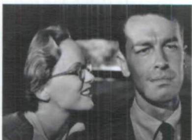
Fig. 13 The Voice in Bart's Ear 2: "I love you," followed by burglar alarm.