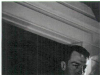
Fig. 33 Bart Descending