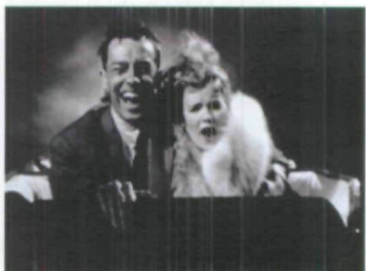
Fig. 29 Les Vampires, Night