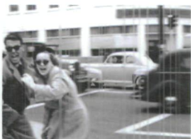
Fig. 14 Les Vampires, day