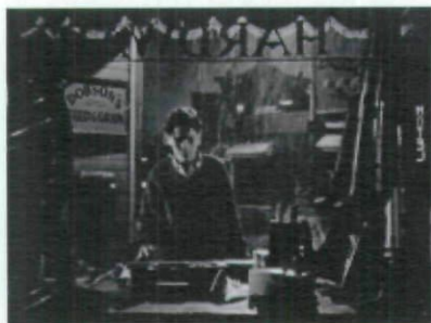
Fig. 19 The Other Side of the Screen 1: Behind the Cracked Window