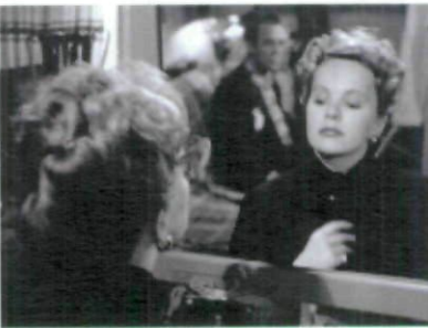
Fig. 24 The Woman in the Mirror 1