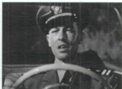
Fig. 9 Disguises 5: Soldier Bart: "It doesn't feel like me."