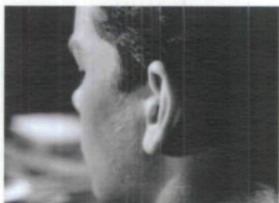
Fig. 11 Bart's Ear