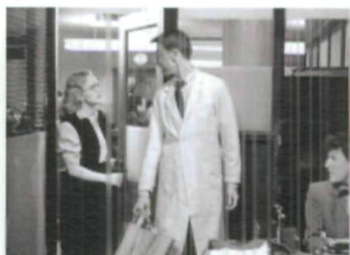
Fig. 10 Disguises 6: Armour Employees: "I've got a girlfriend who works in the front-office."