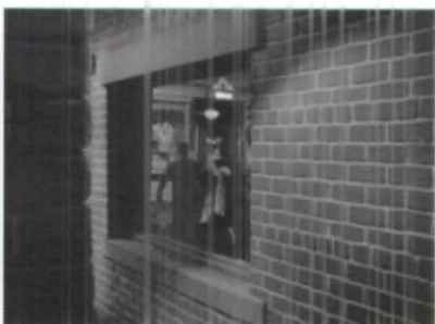
Fig. 30 Window and Mirror, "Death at Work"