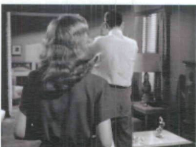
Fig. 15 The Voice in Bart's Ear 3: "I can just kill."