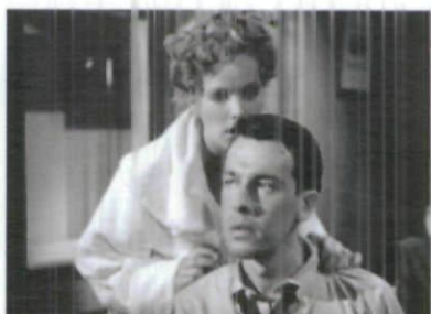
Fig. 12 The Voice in Bart's Ear 1: "When are you going to begin to live?"