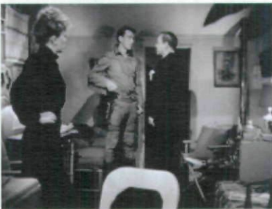
Fig. 20 The Other Side of the Screen 2: Behind the Cracked Mirror