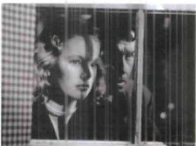
Fig. 32 At Ruby's Window