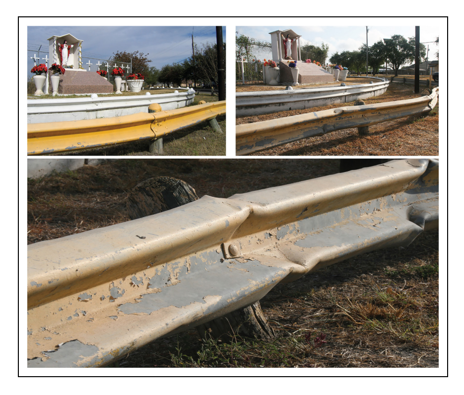
Figure 4. Bryan Road @ Mile 5 Road, Alton, Texas, USA, December 2004 and August 2022. Composition and photographs by the author.

flows. In the end, the juxtaposition of the poinsettia and the aloe together provides the clearest materialization of the larger trauma that the site mediates: the blood-red artificial and recalcitrant poinsettias combined with the fragile, prickly, yet soothing natural aloe daggers peeking out.