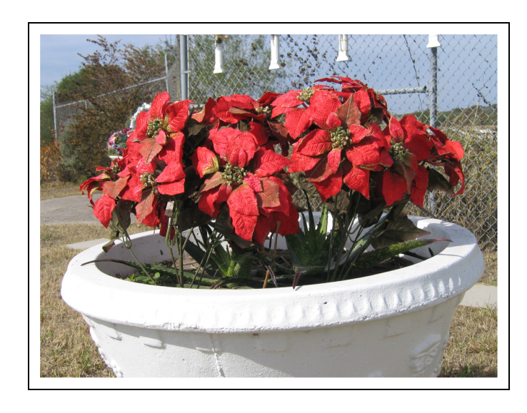
Figure 3. Bryan Road @ Mile 5 Road, Alton, Texas, USA, December 2004.

there more than 30 years on, resolutely refusing to go away, as a recalcitrant matter, asserting the ongoing presence of the trauma it materializes.