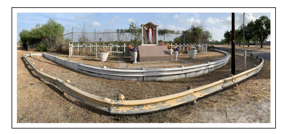
Figure 1. Bryan Road @ Mile 5 Road, Alton, Texas, USA, August 2022.

sensing the site (Seremetakis, 1994). Wherever possible, I also visit shrines recursively, analyzing the way that shrines materially change over time. In my larger project and specifically with my work on the Alton shrine, my main purpose has been to analyze them as visual, material, and spatial forms of communication that involve multiple collectives in the process of translating road trauma from the bodies of intimates, who already know the trauma, to ever-widening collectives of strangers, who only ever know of the trauma through encountering the visual/materiality of the site.