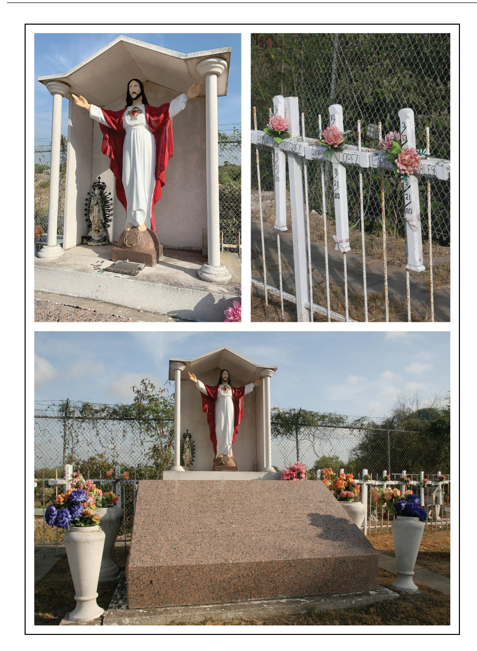
Figure 2. Bryan Road @ Mile 5 Road, Alton, Texas, USA, August 2022.

birth dates and the date of their death rendered in the American abbreviation: 9/21/89. The crosses hang on either side of a vibrantly painted nearly life-size concrete statue of Jesus standing in a concrete pavilion above a monument carved from polished